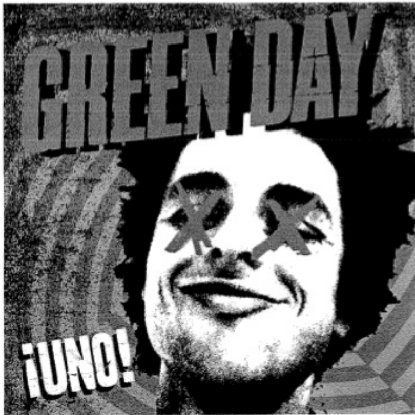
Green Day's '¡Uno!' is the first installment of their album trilogy, including '¡Dookie!' and '¡Trey!' to be released later this year and into 2013.