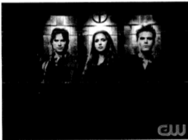
The CW's 'The Vampire Diaries' will premiere the remainder of its fourth season on Thursday, Jan. 17.