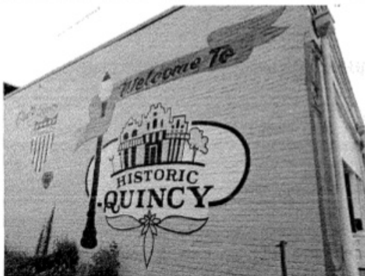
The Quincy Porchfest, a music festival held on various porches, will host 17 local acts from Quincy and Tallahassee.